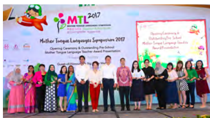
Recipients of the Outstanding Pre-school Mother Tongue Language Teacher Award 2017.

The 6 th Mother Tongue Languages Symposium (MTLS) was held on 19 August 2017. MTLS is organised annually by the Ministry of Education and Mother Tongue Language Learning and Promotion Committees (MTLLPCs) and serves as a platform for educators and parents to interact and find out more about the learning of Mother Tongue Languages (MTLs). The symposium features ongoing efforts by schools, professionals and community groups to help children nurture an interest in MTL.