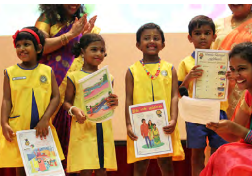
Pre-school children answering questions on the content of Balar Murasu at its launch.

Balar Murasu's content is developed and written by Tamil Murasu Ltd's editorial team and is anchored on a thematic approach that introduces themes suitable for pre-school children, such as "My Home", "My School" and "My Family".