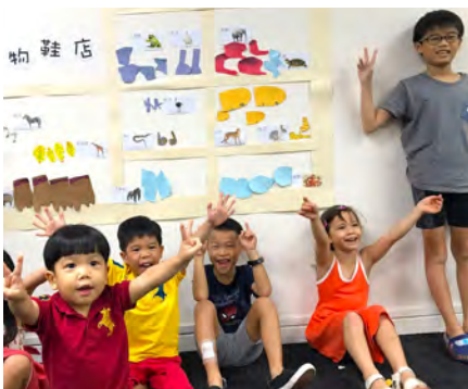
Children showcasing their art pieces.

The Asian Festival of Children's Content (AFCC) is an annual event organised by the National Book Development Council of Singapore. The event brings together content creators, parents, teachers, librarians and members of the public interested in quality Asian content for children. The Fund sponsored the Fun with Languages Programme Workshop under the AFCC, which engaged parents and children in MTL talks and activities. The 15 workshops held over five sessions at three different libraries aimed to promote a love for languages.