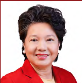
Mrs Yu-Foo Yee Shoon 符喜泉

Chair of the Publicity and Outreach Resource Panel