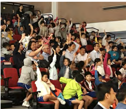
The children enjoying the performance.

The Fund's first supported proposal from a clan association, Singapore Hokkien Huay Kuan Cultural Academy Pte Ltd's Sennett Education Theatre aimed to cultivate students' interest in the Chinese language through a 45-minute play and a post-performance educational activity. The play was based on Chinese cultural values and weaved in Chinese idioms to enhance the appreciation and learning of Chinese learning through the performing arts. About two thousand and four hundred students from twenty-four primary schools participated in the programme.