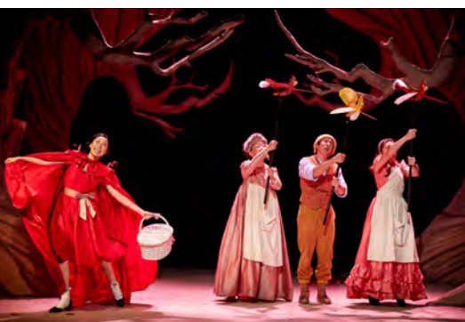
Scenes from the Red Riding Hood in Mandarin .

The Fund supported The Little Company's staging of Red Riding Hood in Mandarin . Red Riding Hood is an uplifting story about a brave girl named Red who journeys through the forest to reunite her family and save Mother's bakery from closing down. Pre-schoolers watched the show with discounted tickets supported by the Fund.