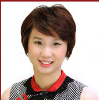
Ms Low Yen Ling 刘燕玲 Vice-Chair

Minister Prime Minister's Office Appointed from 1 October 2015 to 30 April 2018