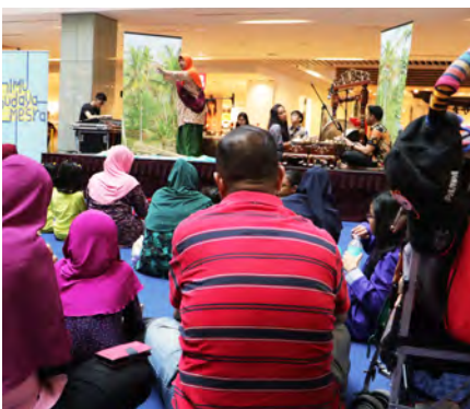
Session at the of OneKM Shopping Mall on 30 September 2017

A total of two storytelling sessions were conducted, each lasting an hour. The first session was part of the Bulan Bahasa launch on 9 September 2017 at the Permanent Galleries at the Malay Heritage Centre. The second performance was held at the atrium of OneKM Shopping Mall on 30 September 2017.