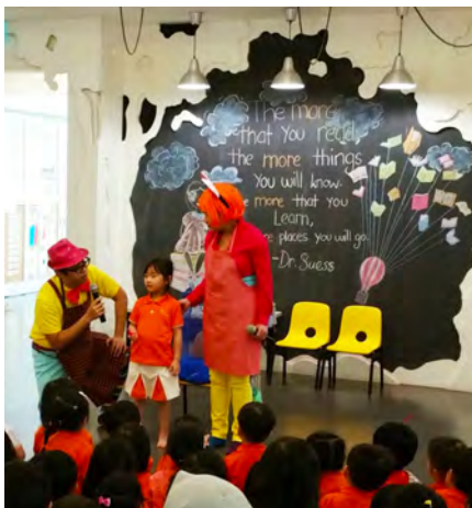
Staging of Rainbow Soup at a pre-school centre.

The Fund supported the staging of Rainbow Soup , a short interactive skit to promote the use and learning of Mother Tongue Languages (MTLs), at various pre-schools. The skit revolves around two best friends, Sam and Pam. They love to sing, dance and have fun together. When they realise that there was nothing to eat one day, the creative duo decides to cook up a delicious rainbow soup filled with all sorts of marvellous ingredients. Through the skit and interaction with the cast, the children present were exposed to vocabulary in different MTLs in a fun and light-hearted way.