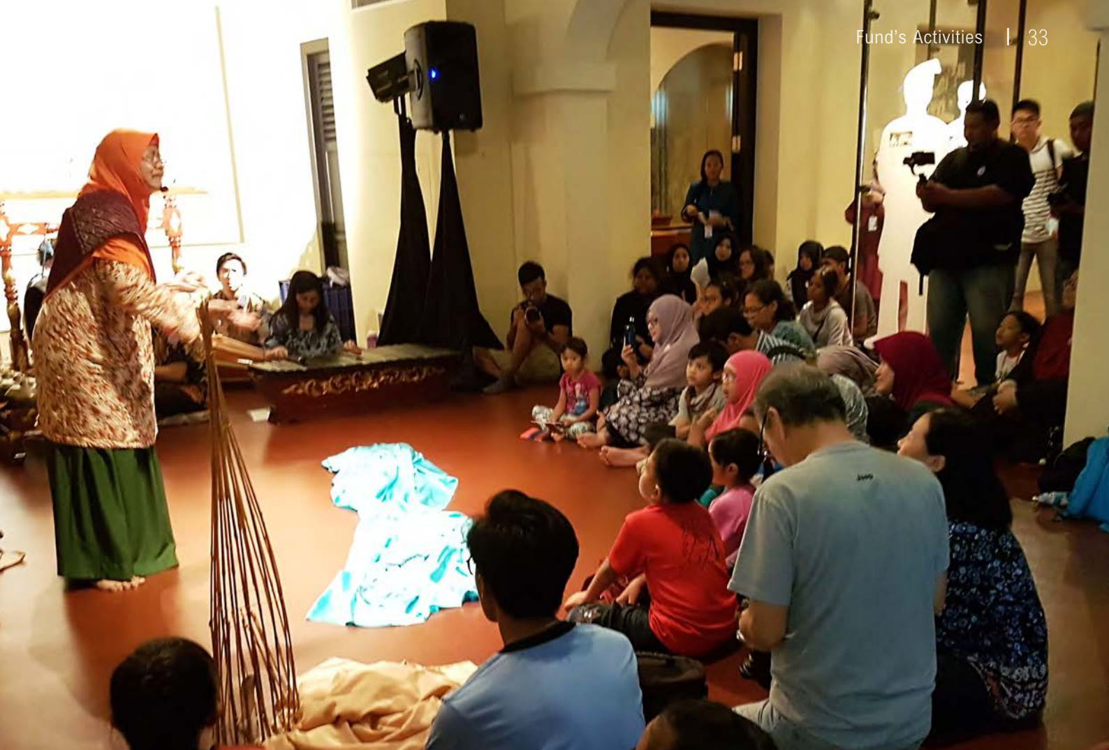
Session at the launch of Bulan Bahasa at the Malay Heritage Centre.