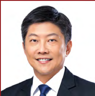
Mr Ng Chee Meng 黄志明 Former Chair

Minister for Education Appointed on 5 June 2018