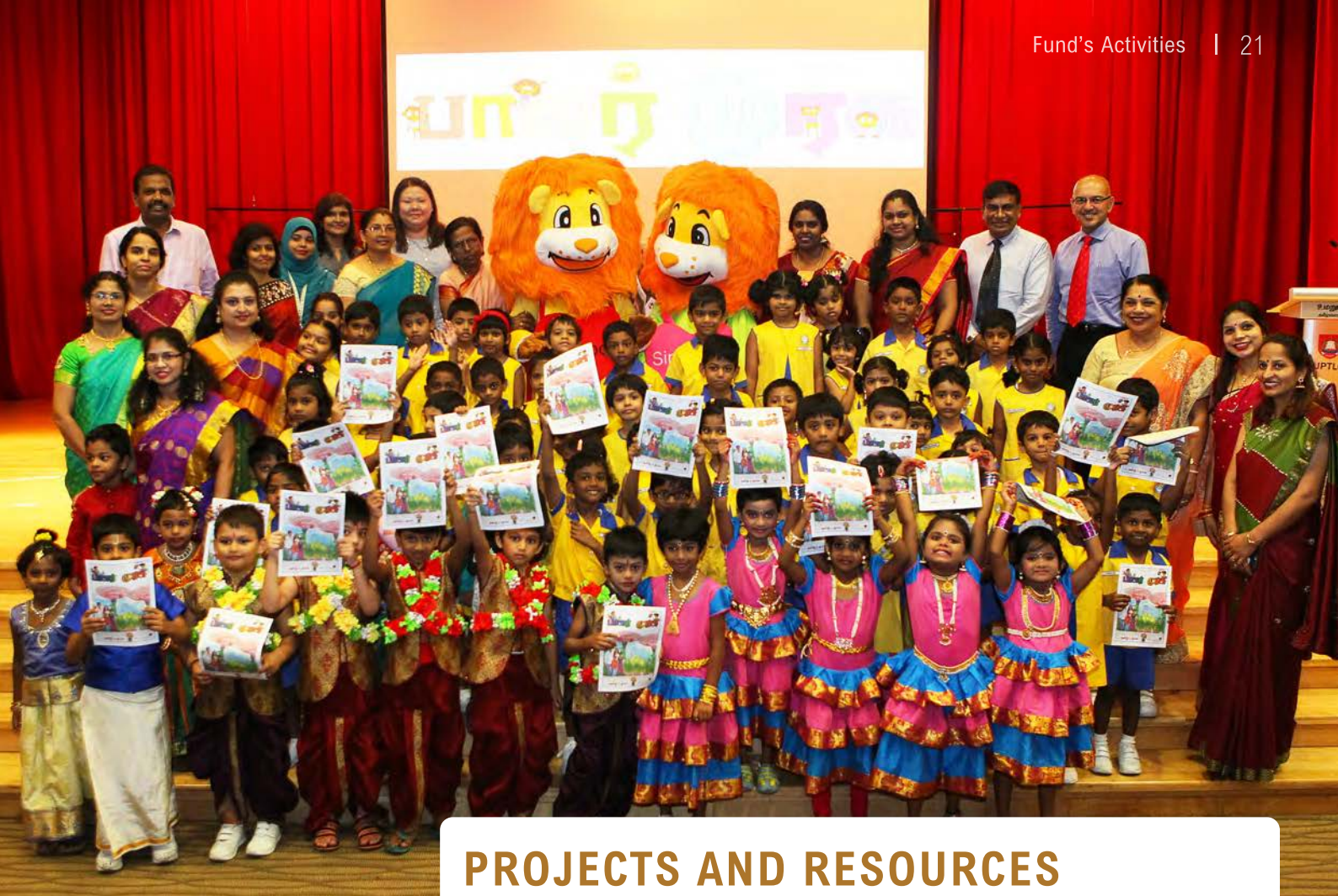
Launch of Balar Murasu at Umar Pulavar Tamil Language Centre on 25 April 2017.