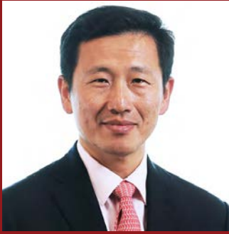
Mr Ong Ye Kung 王乙康 Chair

Minister for Education Appointed on 5 June 2018