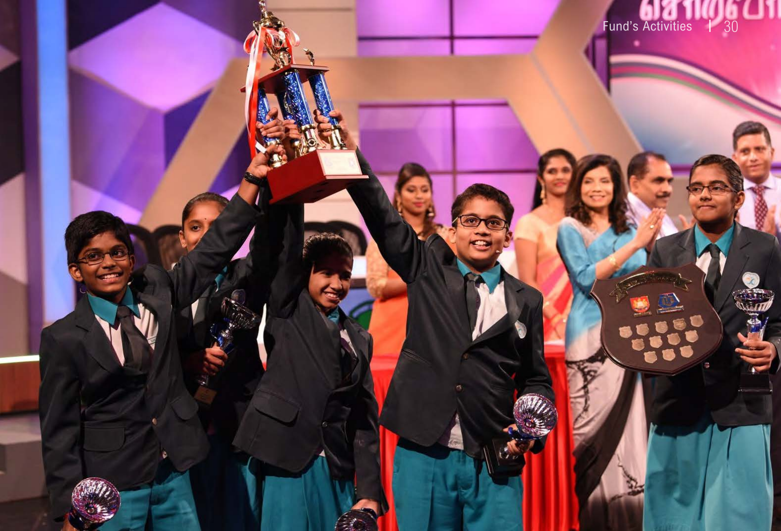
The winning team of Sorpor 2017.