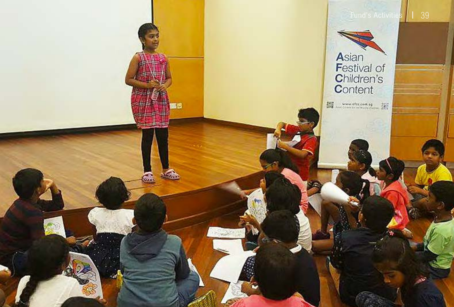
Tamil Language session during the Fun with Languages Programme.