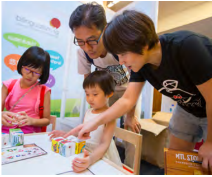
LKYFB Exhibition booth at MTLs and its showcase of sponsored resources.

The 6 th Mother Tongue Languages Symposium (MTLS) was held on 19 August 2017. MTLS is organised annually by the Ministry of Education and Mother Tongue Language Learning and Promotion Committees (MTLLPCs) and serves as a platform for educators and parents to interact and find out more about the learning of Mother Tongue Languages (MTLs). The symposium features ongoing efforts by schools, professionals and community groups to help children nurture an interest in MTL.