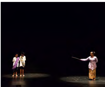
Scenes from the winning performance.

Sayembara Theatre 2000, a Malay drama competition and performance attracted about 10 participating groups. Participants went through a drama workshop/sharing session conducted by the competition's four judges to enhance their skills in preparation for the competition. The competition attracted about 700 audience members, and the winner's performance on 13 January 2018 was attended by about 260 audience members and graced by Minister Masagos Zulkifli, Minister for the Environment and Water Resources & Minister-in-charge of Muslim Affairs.