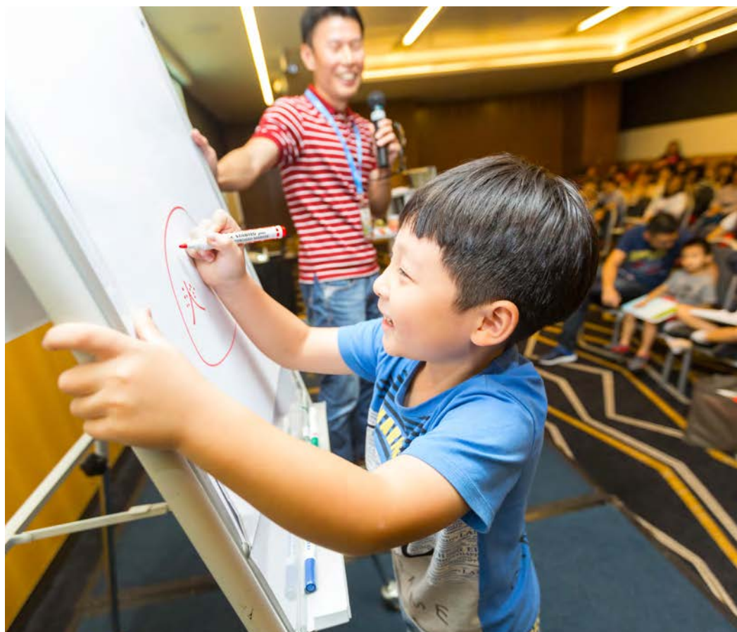
A young participant enjoying the session and demonstrating his creativity.