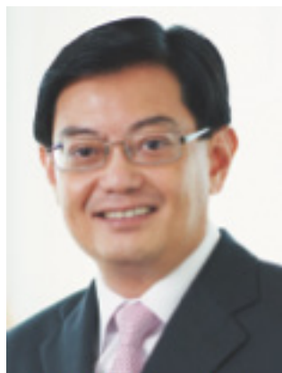
Mr Heng Swee Keat (王瑞杰)